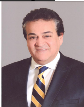
Khaled Abdel Ghaffar Minister of Higher Education & Scientific Research