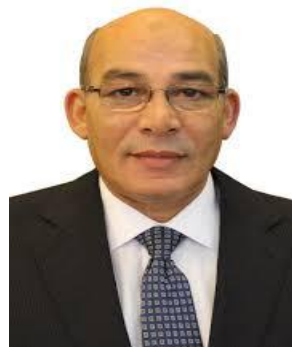
Prof. Dr. Abdel-Moneim El-Banna, Minister of Agriculture and Land Reclamation