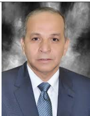
General / Mahmoud Ashmawy Qalyoubia Governor